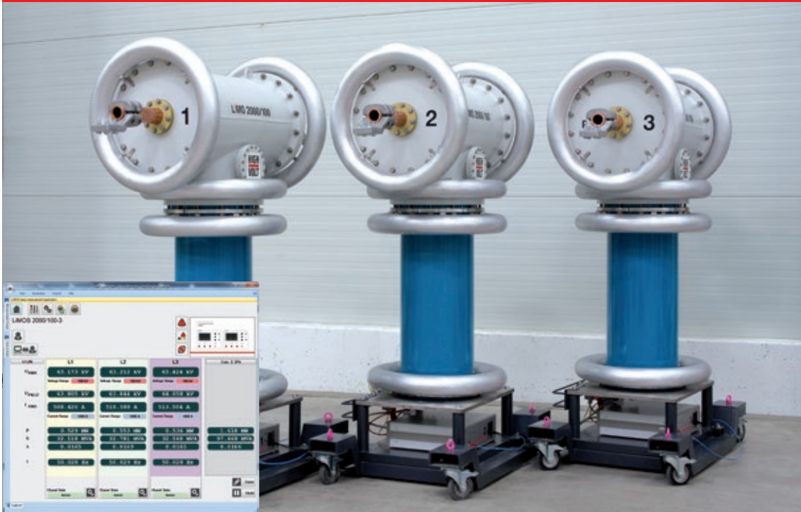
Fig. 1 LiMOS 2000/100 consisting of three sensors with measuring and transmitting units (MTU) and the remote screen