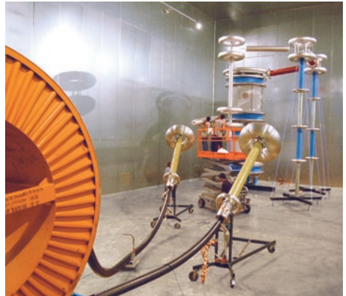
Fig. 5 Water-filled test terminations used for an AC routine test of a high voltage cable

* One system consists of two terminations and the corresponding water conditioning unit from the table. ** The cable test termination systems can be used with various cable diameters (across extruded insulation): Types CETS .../120-... for cables from 30 to 120 mm Types CETS .../160-... for cables from 55 to 160 mm