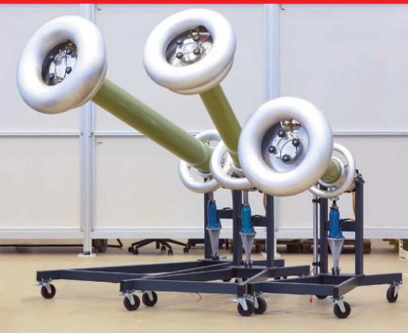
Fig. 3 Water-filled test terminations, type CET, several nominal voltages