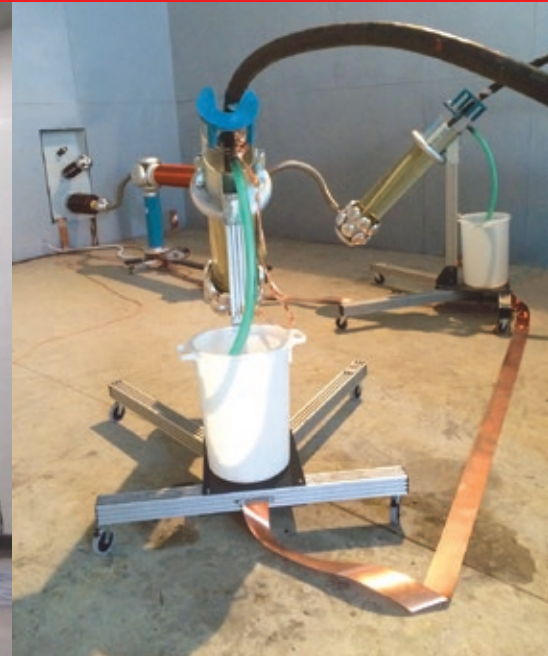
Fig. 2 Oil-filled test terminations, type EKP