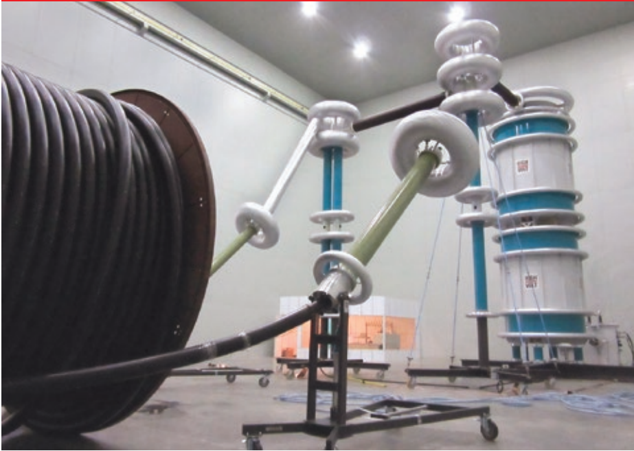
Fig. 1 Water-filled test terminations, type CET