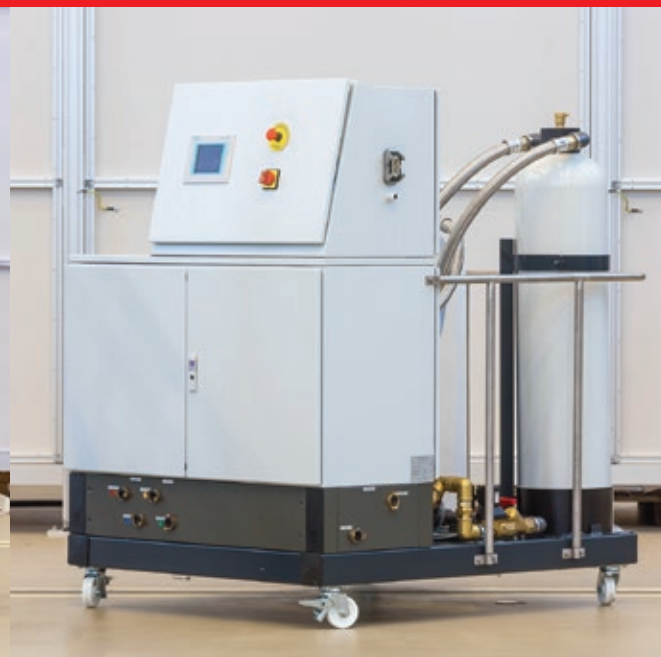
Fig. 4 Water conditioning unit, type CEU