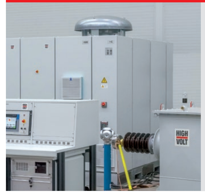
Fig. 1 Fully automated control system and frequency converter