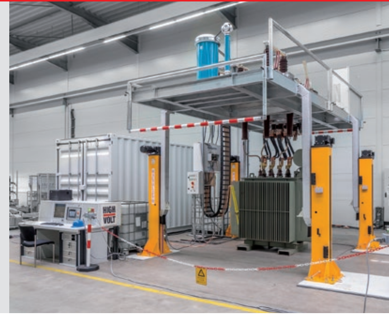
Fig. 2 Example showing the practical implementation of a customerspecific automatic switching system with height adjustment