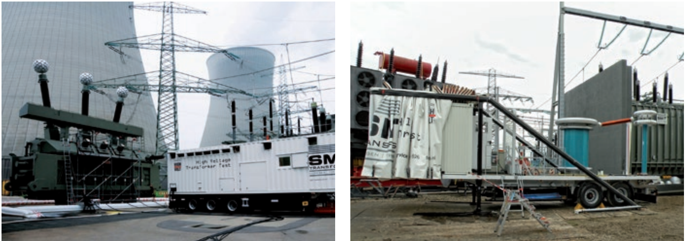
Fig. 4 Test system for on-site tests on transformers (left: WV 620-1000/80, right: extension for applied voltage tests WRV 5/360 M)