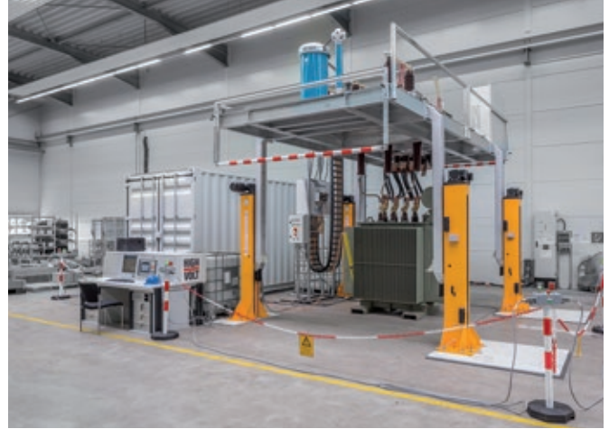
Fig. 1 Test system for type- and routine tests on distribution transformers (left: test voltage source and control system, right: automatic switching system)