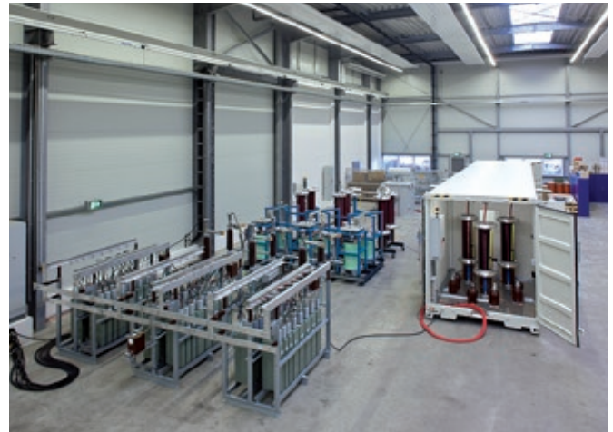
Fig. 3 Test system for medium power transformers (left: test voltage source 1 MW/2 MVA [SFC] in 40 ft container, right: test system 620kW/1MVA + HVCC)