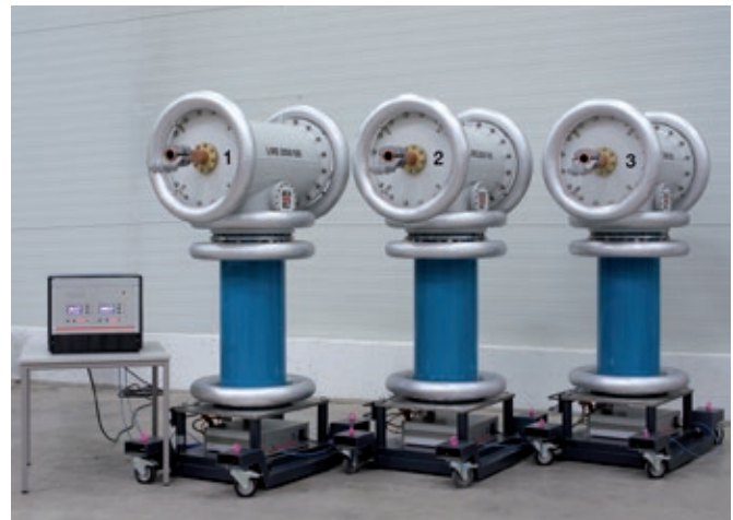
Fig. 4 Test system for large power transformers (left: 2 MW 4 MVA [SFC], tapped transformer and filters, right: loss measuring system LiMOS 2000/100-3)