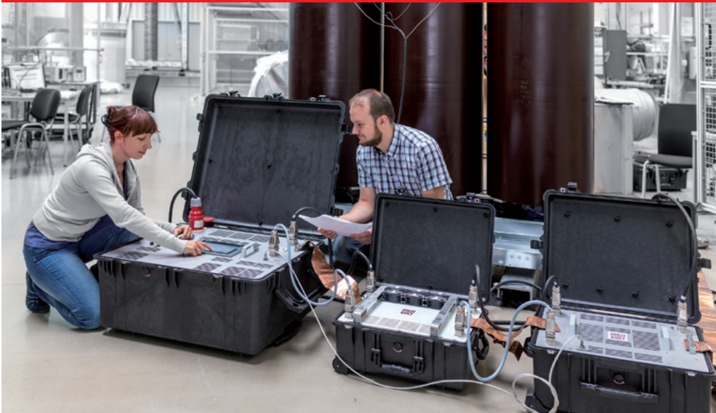
Fig. 1 Portable test source WV 18-18/1.4