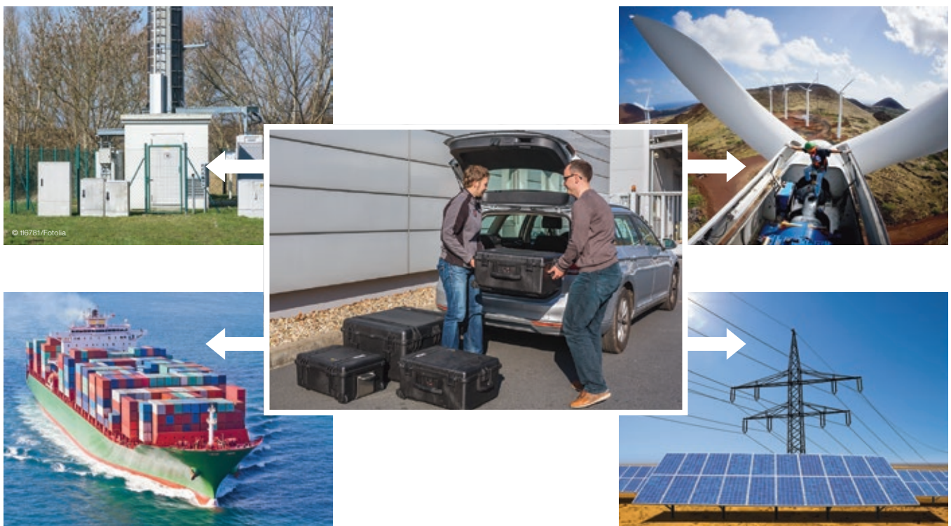
Fig. 3 Applications for the test source WV 18-18/1.4 for testing of distribution transformers (selection)